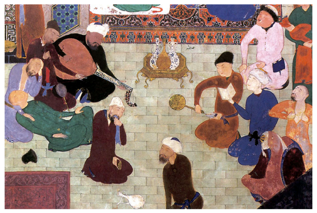
Kamoliddin Behzod. Miniature illustration (fragment). Sultan Hussein Baykara in his courtyard in Herat. 1488. Edited by the article authors.

Critical issues of nuclear power plants in Uzbekistan